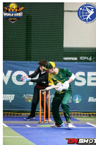
MCA players taking part in Junior World Series in Christchurch were as follows (all N Midd):

Last October for the first time, age group indoor world cups were held in Christchurch, New Zealand & all 3 England teams included boys from our clubs. A notable achievement indeed. It was amazing that so many MCA colts got through the selection process.