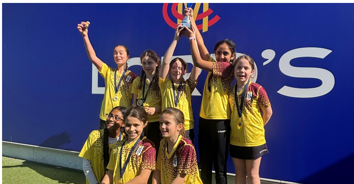
South Hampstead Girls U11s dominated their age group