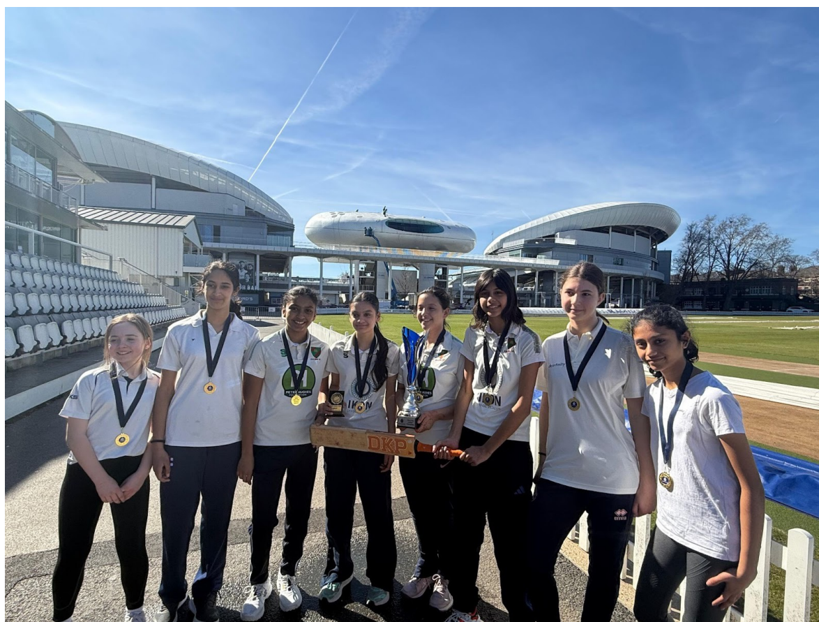
Ealing retained their title in a final between two very good sides.

The final Old Camdenians pair needed 36 to win off as many balls. They batted valiantly, producing the biggest partnership of the match, and yet it was not to be; they entered the final over needing 16 and a disciplined and controlled fielding performance left them eight short on 59.